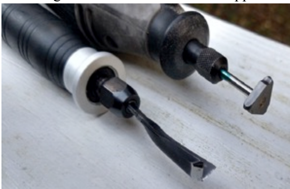
V-Cut Chisel and Rotary Carbide Cutter

With the finial shaped, it was time to finish the outside with some carving. Prior to any carving, Benoit put a line along the seam of the box. He stopped to remove pressure from the tail stock a few times to make sure the cut along the seam was correct on both pieces of the box. He then added a line above and below the seam. Benoit then demonstrated the different texturing tools he uses to embellish his boxes. A couple of tools Benoit likes to use to embellish his boxes with a dremel type tool with a rotary cutter and a reciprocating carver with a V-Cut chisel attached. I wanted to provide a link to the cutter but I was unable to locate them online. I believe I ordered mine a couple years ago after watching a video off of Treeline USA's website where Brian Nish was demonstrating the cutter for texturing/carving. I found my order and I believe they called it a "Medium Rounded Rotary Chisel" but when I checked their website I