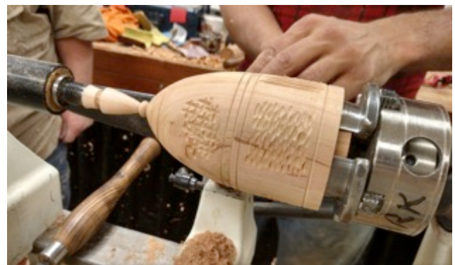
Different Ways to Texture

The top of the box was started the same as the bottom. We cleaned the face up with the skew by performing a slicing cut. Next we had to determine the size of our tenon. We cut 1/16" of an inch off the end to size up our tenon to match the opening of the bottom piece of our box. Once we had the size determined, we proceeded to hollow out the top with what else...the back hollowing cut. After roughing out the inside to the depth we wanted, we used round nose scraper to smooth and shape the inside. With the inside finished, we proceed to cut the rest of our tenon. Benoit normally has big tenon's on his boxes so ours ended up being about a half inch in length.