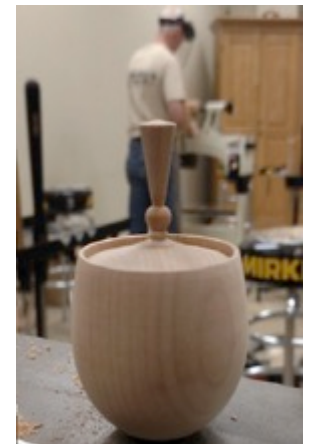
First Box in Class

Benoit did a great job explaining to us how to make the cut. If you have seen the cut before, you know it's kind of a rocking motion with the tool handle going up and down. The big key is to keep the bottom edge of the tool shaft always in contact with the wood as the bevel of the spindle gouge rides up and down while peeling away wood. By keeping the tool shaft always in contact with the wood, it acts as a fulcrum. Another key is once you start the cut, keep the cut going and keep the bevel always in contact with the wood.