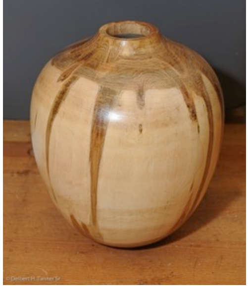
Page 6 atlantawoodturnersguild.org