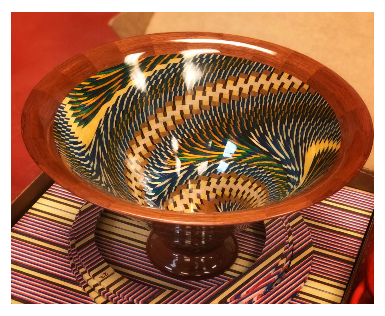
Close up view of a vortex bowl completed by Pete Marken.