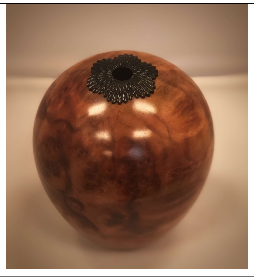
Harvey Meyer, Natural edge Bowl, Yellow Box Burl, MinWax Antique Oil