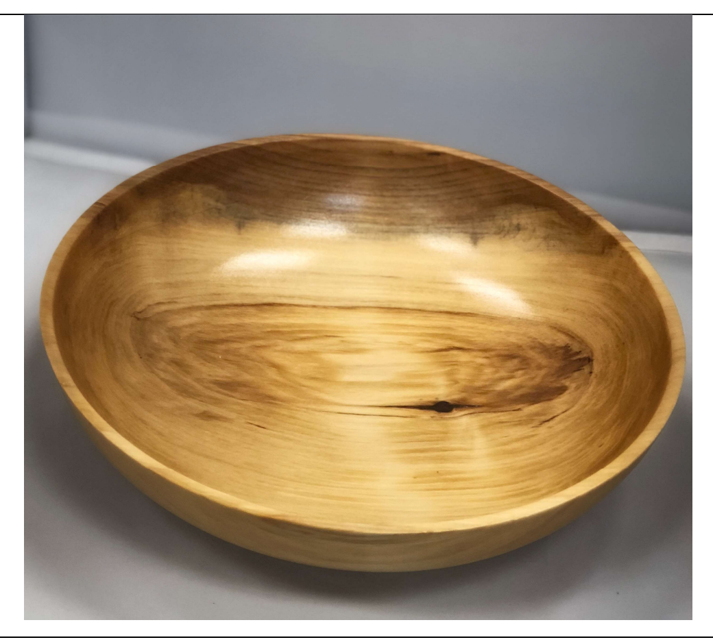
Unknown artist #2, Bowl #2, Unknown species, unknown finish

Unknown artist, Bowl, Unknown species, unknown finish